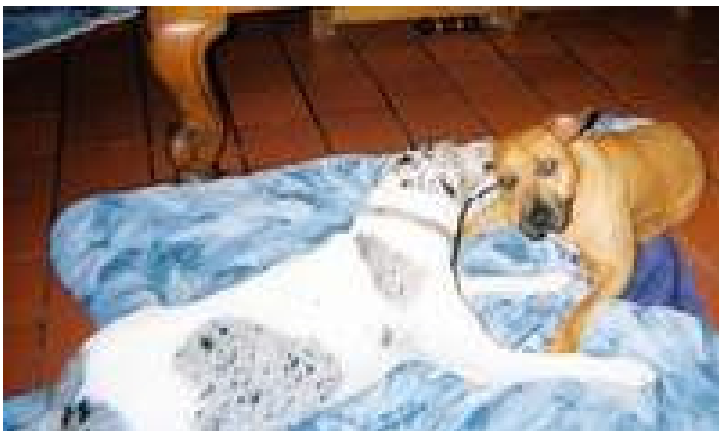
Psssst...They only think I'm deaf and blind.