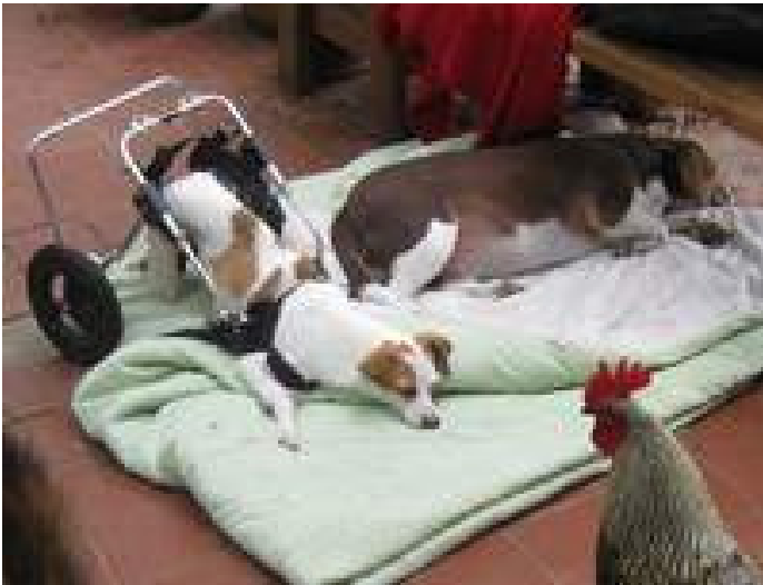
Out of gas