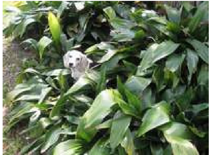
Grow your own dog