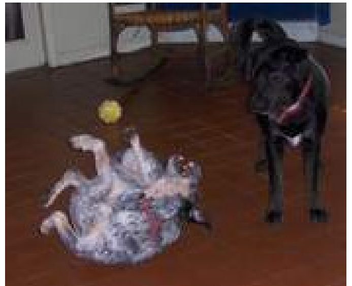
I can juggle one ball at a time.